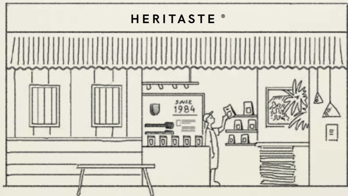
Taste of Malaysia

To offer immersive, culturally rich retail experiences in places like Kuala Lumpur, Melaka, Penang, and Langkawi.